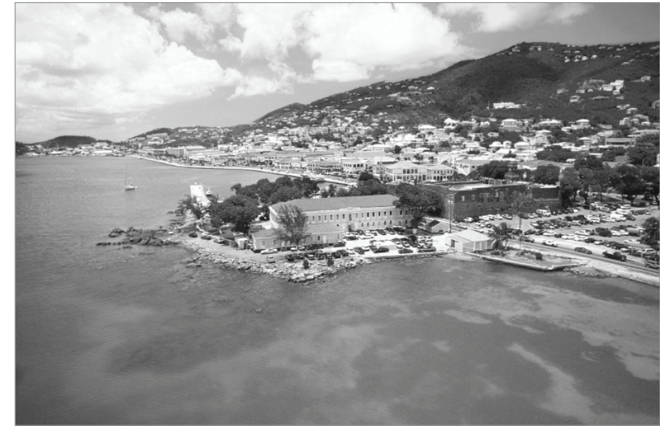
View of Charlotte Amalie, St. Thomas

Currency: U.S. Dollar (USD). Credit cards are widely accepted.