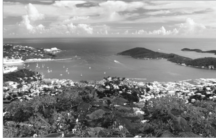
The view from Skyline drive looking across the town of Charlotte Amalie

For family-sized activities, check out Turtle Cove on Buck Island. But don't let the kids have all the fun. Hop aboard a catamaran and let champagne and relaxing music take you into a world beyond relaxation and romance.