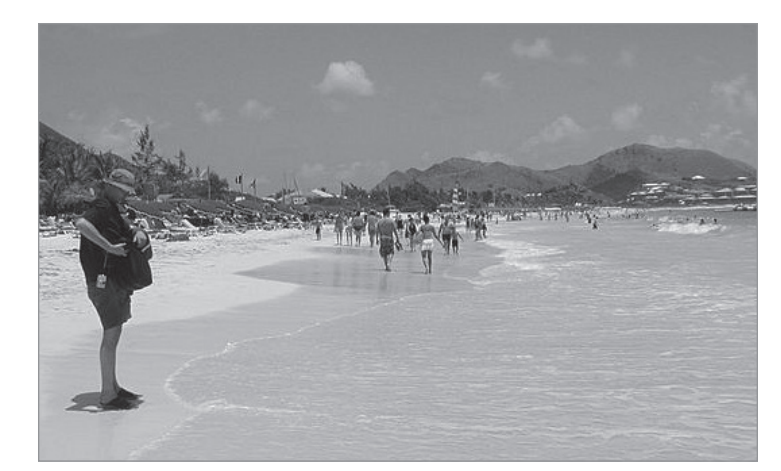
Beautiful beaches at every turn

With over 10 miles of sugar-sand beaches, St. Maarten is a spectacular place to simply get outside and enjoy. Whether sailing, snorkeling, scuba diving or helmet diving, this little island boasts more marinas per square mile than anywhere else on earth.