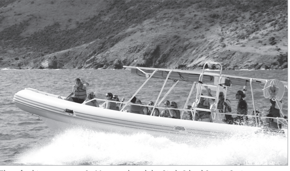
The refreshing way to see St. Maarten aboard the Circle Island Scenic Cruise

Currency: The guilder (NFL) is the official currency on the Dutch side, while the Euro (EUR) is used on the French side. The U.S. Dollar (USD) is accepted throughout the island.